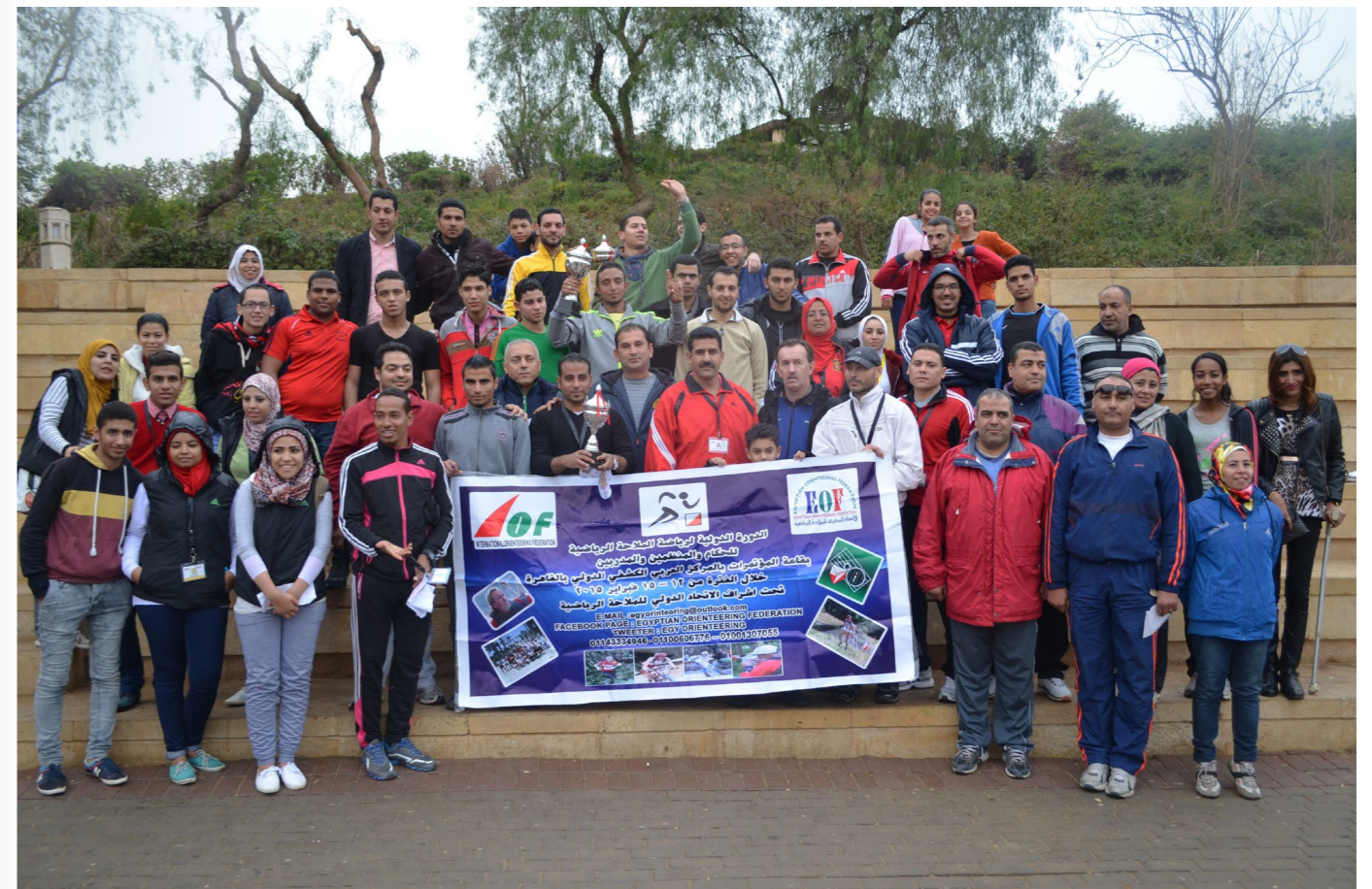
Happy participants of the first IOF Development Seminar in Egypt.