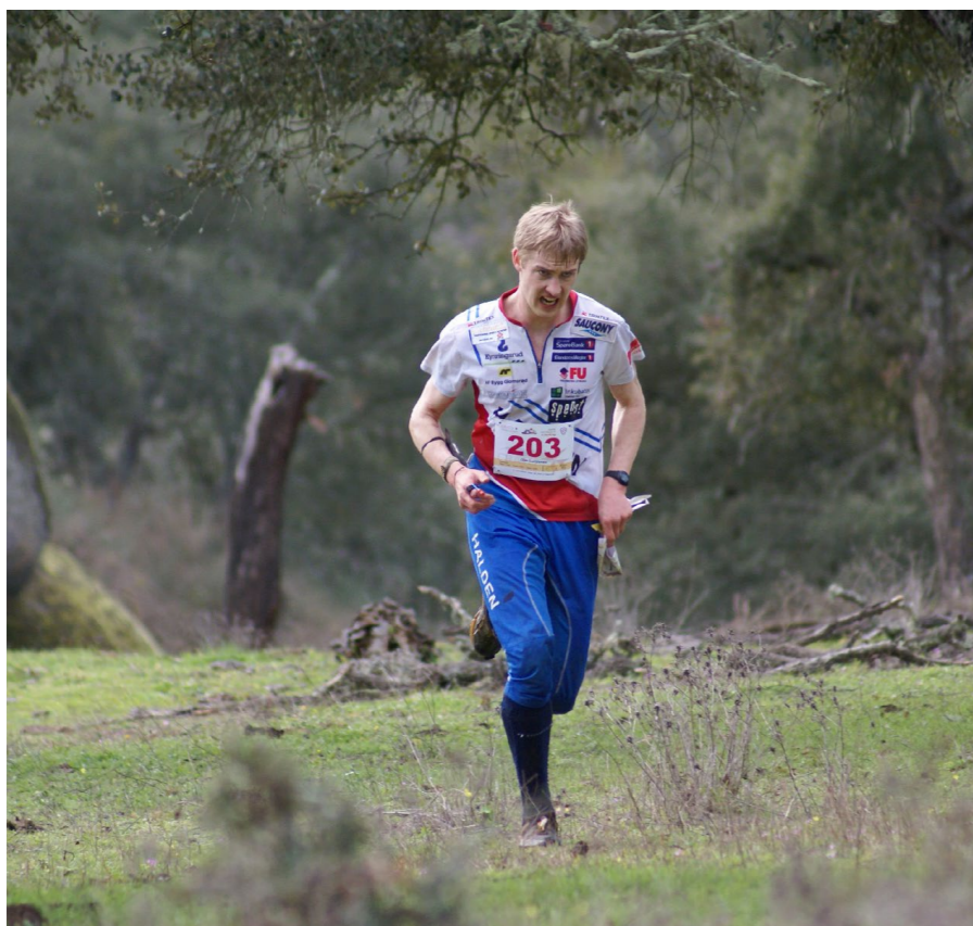
Norte Alentejo O' Meeting