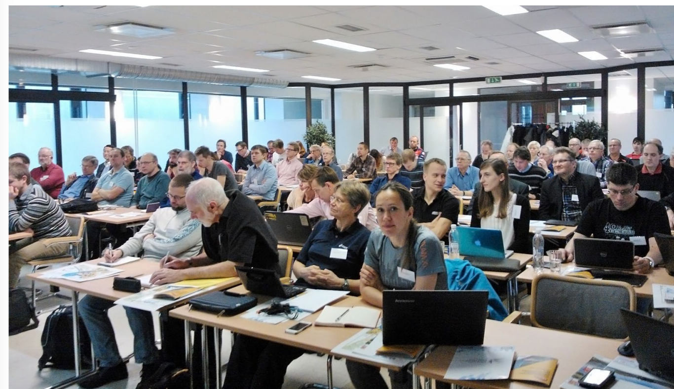
There was a record participation at the HLES this year.

As a new member of the Foot Orienteering Commission it was really encouraging to meet so many really skilled people committed to making the most out of our sport.